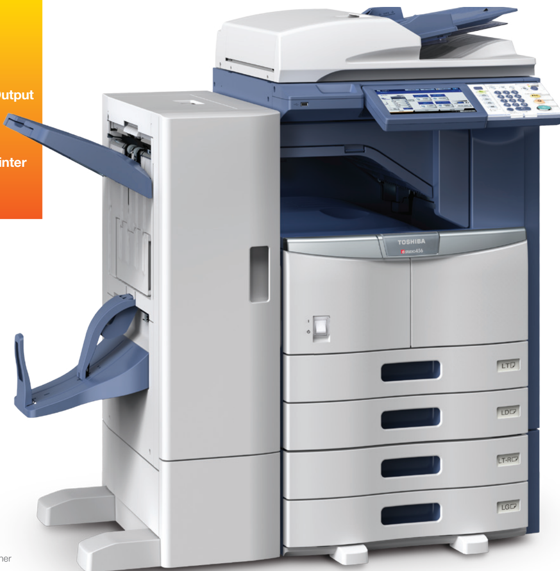
e-STUDIO456 with Saddle-Stitch Finisher