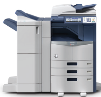
e-STUDIO456 with 2,000-Sheet LCF, Hole Punch, and 50-Sheet Staple Console Finisher.