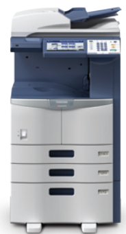
e-STUDIO456 with 2,000-Sheet LCF.