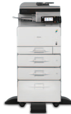
MP C305 with two optional PB1050 Paper Trays