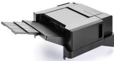
300-SHEET FINISHER DF-5100 Output capacity of up to 300 sheets with stapling of up to 50 sheets in three positions.