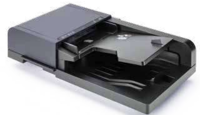
DOCUMENT PROCESSOR DP-5100 75-sheet document processor, automatically reverses double-sided documents.