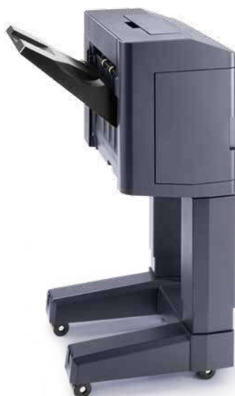
1,000-SHEET FINISHER DF-5110 1,000-sheet finisher for large outputs. Stapling of up to 50 sheets in three positions plus optional punching.